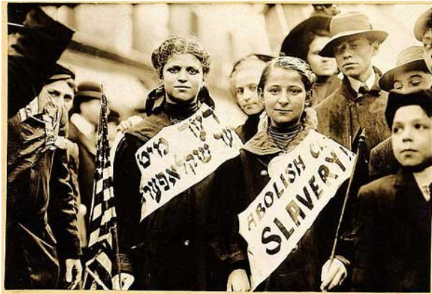
Two girls wearing banners with slogan "ABOLISH CHILD SLAVERY!!" in English and Yiddish, one carrying American flag; spectators stand nearby. Probably taken during May 1, 1909 labor parade in New York City.

Jews were also, and still are today, retailers, manufacturers, and factory owners in the garment industry. This history, and diversity of perspectives, allows us to better understand – and work to eradicate – modern-day sweatshops.